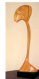
Emerging in a Wood, I'll Wait Where Once My Lover Stood Lindenwood 7' tall