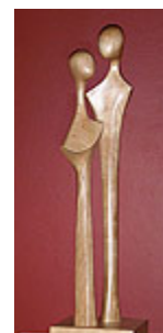
Lovers American Cherry Wood 19" tall