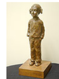
Andrea Bronze 14" high