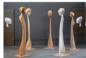
Echo in the Forest Lindenwood 6-7 feet tall, paper castings

Media: Sculpture Studio: 32 (click for map location) Phone: 703.629.3620 Email: tatyana.ss@verizon.net