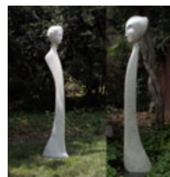
Tango and Buddha Forton 6' tall