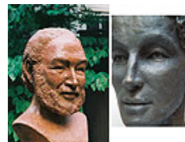
Portraits Terracotta life size